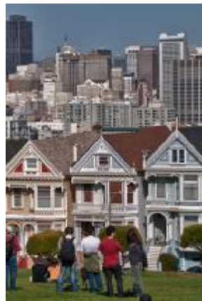
Forth set below was exposed as above and again shifting the camea to the right.